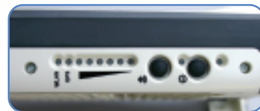
Front view, close-up